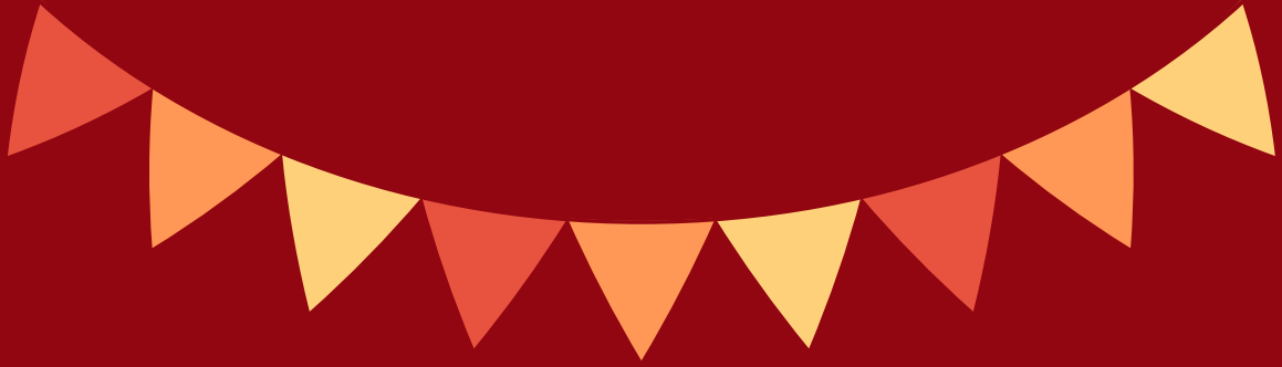
PHOTO BOOTH & CUTOUTS