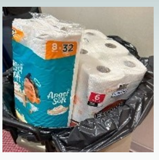
Paper products and items donated by FLC to the Catholic Action Center