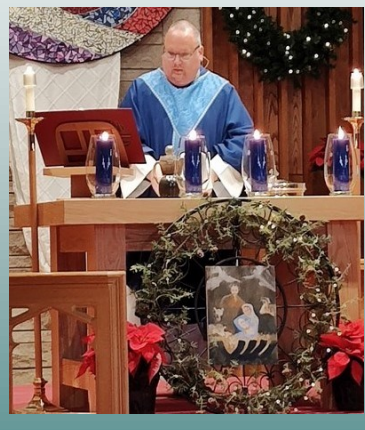
A Blue Christmas service was held December 22. Many who attended were moved to tears.