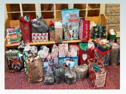
Gifts from FLC for the Santa for Senior Program