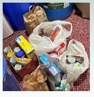
Food items donated by FLC to God's Pantry