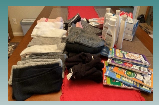
Items for senior stockings.