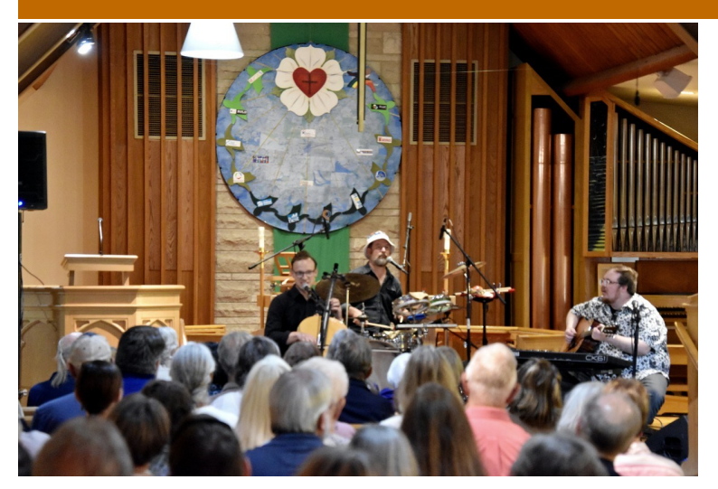
Musician Ben Sollee performed at a sold out Harstad Fine Arts Series event Sunday, September 15.